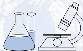
Easy but very important task